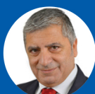
Giorgos Patoulis President of KEDE, Mayor of Amaroussi (Greece)