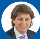
Carlos Martínez Mínguez Mayor of Soria (Spain)