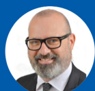
Stefano Bonaccini President of AICCRE, President of Emilia Romagna (Italy)