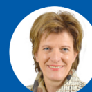
Christine Oppitz-Plörer Deputy Mayor, Innsbruck (Austria)