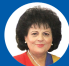
Mariana Gâju Mayor of Cumpăna (Romania)