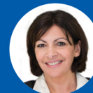
Anne Hidalgo Mayor of Paris (France)