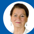
Annemarie Penn-Te Strake Mayor of Maastricht (Netherlands)