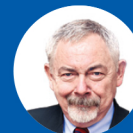
Jacek Majchrowski Mayor of Krakow (Poland)