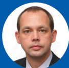
Petr Kulhánek Mayor of Karlovy Vary (Czech Republic)