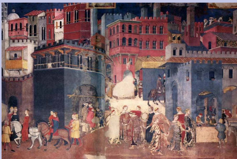
The Good Government, Ambrogio Lorenzetti, Sienna (Italy), Palazzo Pubblico (1338).