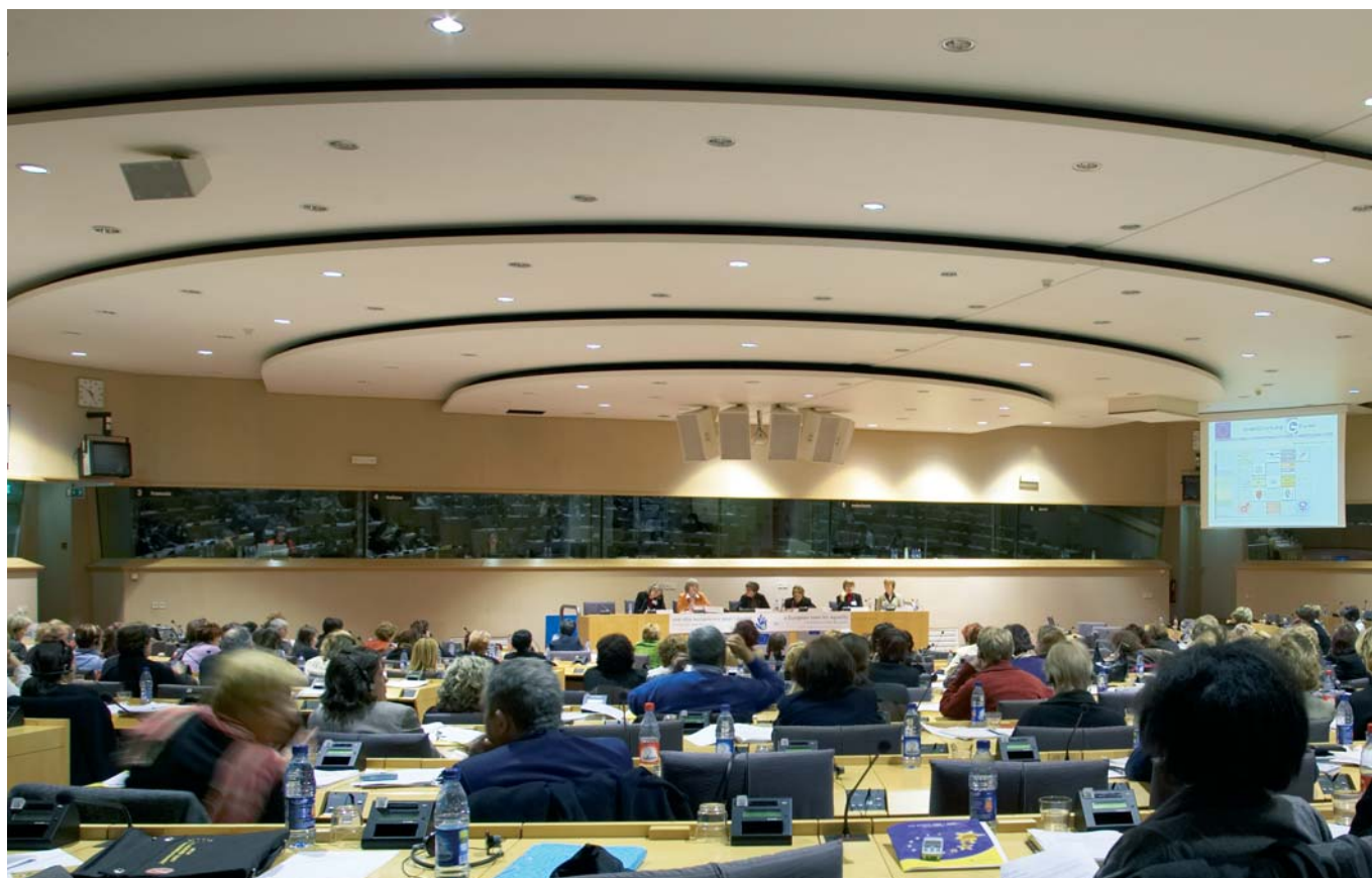
Final conference of the "Equality in European Towns" project, Brussels, European Parliament, February 2005.