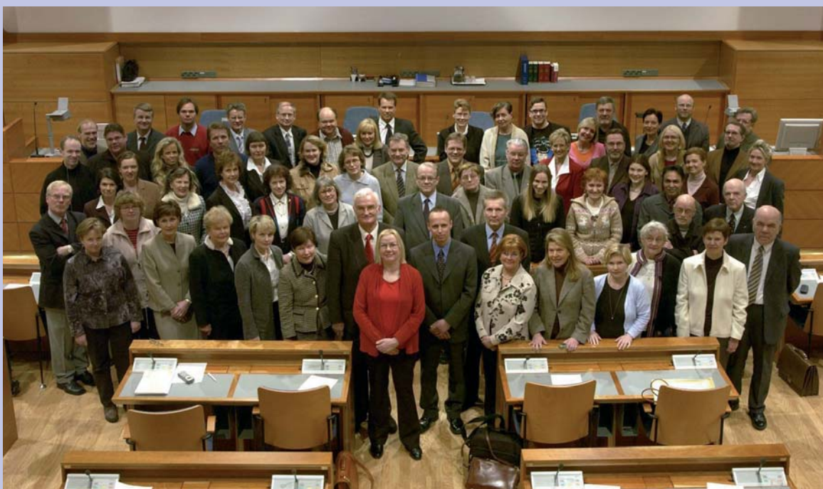
The Municipal Council of Espoo (Finland): an example of a balanced assembly.

Similarly the needs of other specific groups of women need to be addressed by appropriate action frameworks.